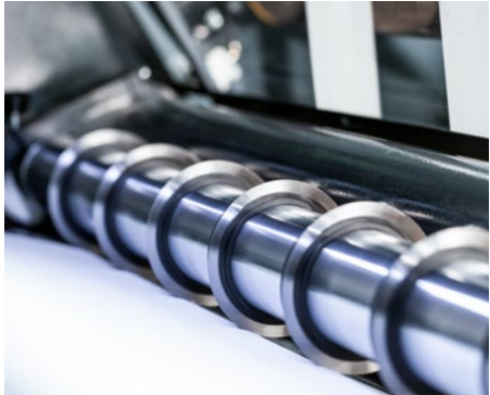
Scissor cut For best quality with long service life.