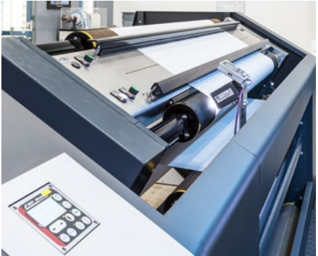
Splicing table High-quality splices made simple.